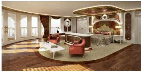
VIP Suite - Bedroom

The VIP suites have the added luxury of a private office. On the same level and located centrally to the guest suites are the Library, Communal Office, Communal Balcony and Cinema. The upper level of the Atrium leads to the main entertainment areas and the Owners suite. The entertainment areas comprise the Main Saloon with separate Havana room and adjoining wine cellar, the Dining Room, Casino and Dance Hall. At the farthest end of the Atrium lies the Owners Apartment. Connected to all decks via a private lift and spread over 3 floors, it covers a total 1460m 2 of floor space. As well as the usual lounge with a feature fire place and double height ceiling, office, bedroom, bathroom, his/hers dressing rooms, the apartment also benefits from a listening room, private courtyard, sunroom, numerous balconies and private sundeck with a Jacuzzi/swimming pool.