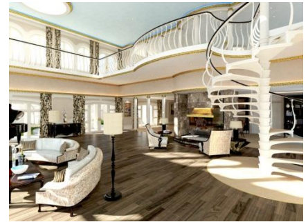
Owners Apartment - Living Room

'The Grand Atrium' is the central hub of the yacht, linking the upper and lower living areas. At its centre is a large, ornate spiral staircase which surrounds a waterfall feature that is supplied by the glass bottomed fountain from the garden area above. A small cafe/bar area ensures this feature can be enjoyed while relaxing in comfort. The seven guest suites are located off of the lower atrium level and vary in size, from the more modest 135 m 2 suite to the grand 356 m 2 VIP suites. All include their own reception room, bathroom,