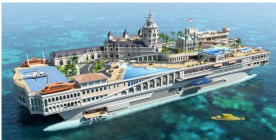
The Streets of Monaco

In order to showcase its capabilities, Yacht Island Design has set about developing several concept proposals. The first of these is 'The Streets of Monaco'. This is a 155m SWATH yacht built predominantly in steel with the use of aluminium in the upper superstructure. With a maximum speed of 15 knots she transports her 70 crew and 16 guests using diesel electric propulsion. The design theme called for a unique yacht that reflected the style and sophistication of the principality and centres around three main communal areas, 'The Streets of Monaco', 'The Oasis' and 'The Grand Atrium'.